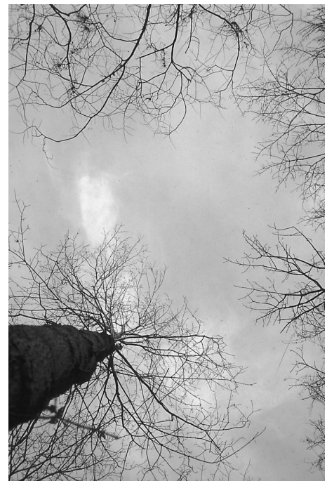
Figure 1. Crop tree after release.

In an unmanaged woodland, competition among trees for light, water, and nutrients is often severe and can result in slow growth or even the death of the more desirable trees. In a woodland under crop-tree management, these crop trees are freed from excessive competition by reducing or eliminating some of the less desirable competing trees. The released 1 crop trees are healthier and more vigorous, more insect and disease resistant, grow faster, and produce additional landowner benefits.